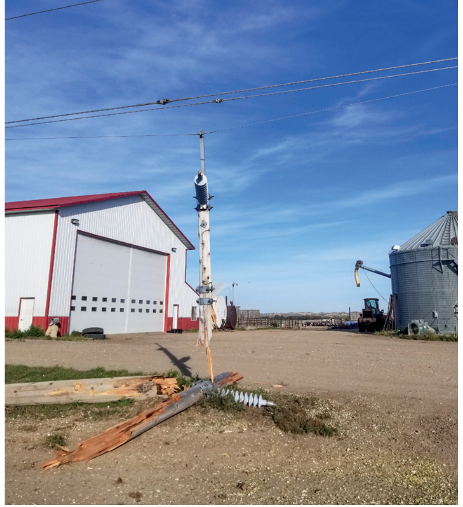
Basin Electric Power Cooperative's pole was badly damaged during a hit-and-run accident. Don't let appearances fool you – the line is still energized.

3200 W. Holly Sidney, MT 59270 Phone: 406-488-1602 Toll Free: 844-441-5627 Fax: 406-488-6524