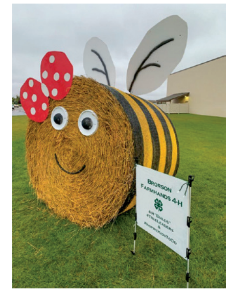
The Brorson Farm Hands 4-H Club received an Operation Round Up grant of $150 for the materials needed to create the hay bale used in the community bale decorating contest.