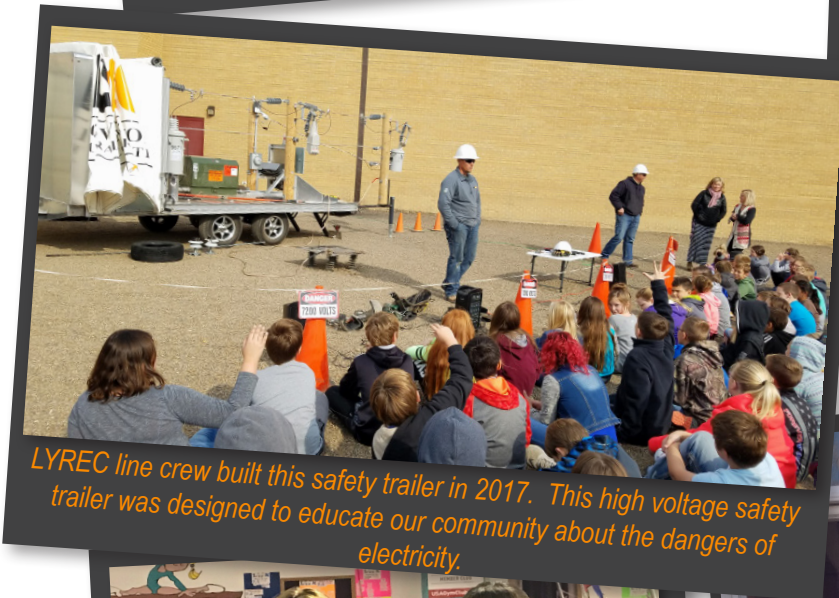
LYREC line crew built this safety trailer in 2017. This high voltage safety trailer was designed to educate our community about the dangers of electricity.