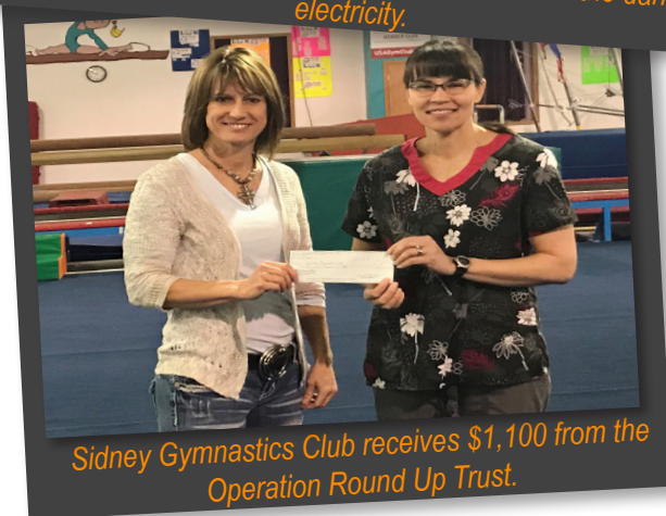
Sidney Gymnastics Club receives $1,100 from the Operation Round Up Trust.