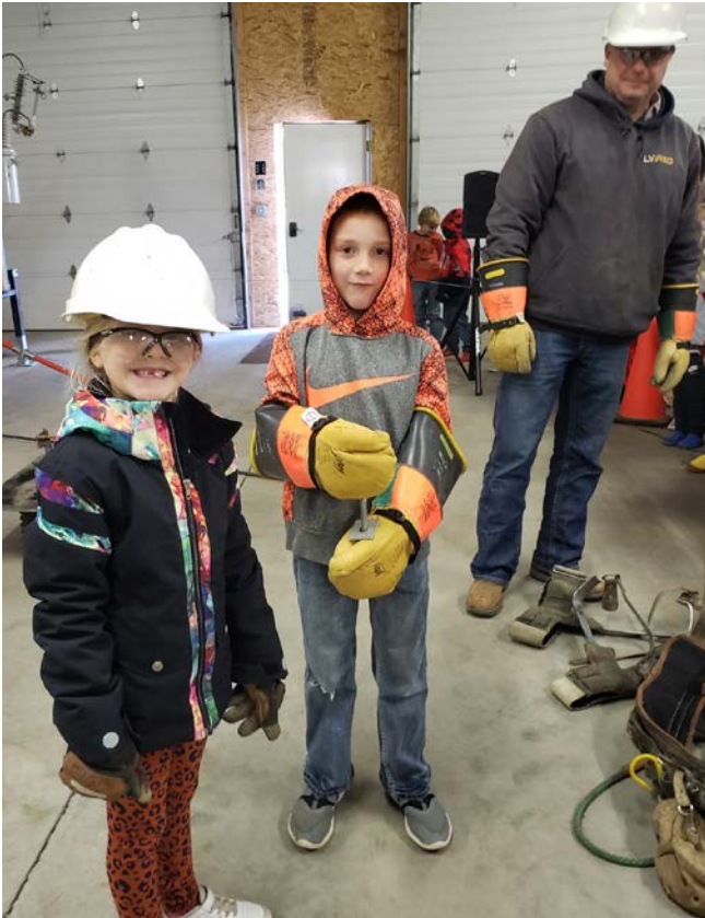
The students donned the lineworkers' safety gear during the safety demonstration.