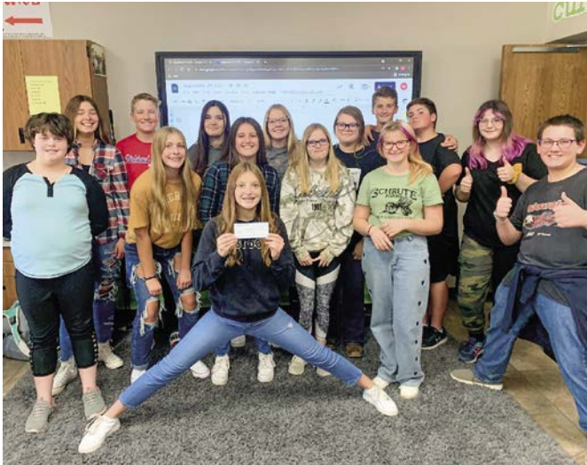
The Sidney Middle School yearbook and announcement class received $300 to purchase new software that will make editing their daily announcements quicker and more proficient.

The popularity of the program continues to grow. We hope the community realizes what an impact you are making with your contributions each month. Thank you to our generous members who continue to donate monthly to the ORU Trust. ■