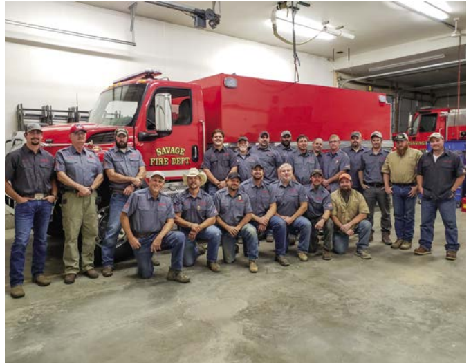
The Savage Volunteer Fire Department received an ORU grant for $1,000. The funds will be used to replace and purchase additional two-way radios.