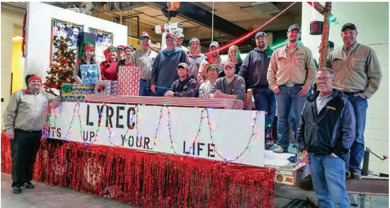
LYREC employees decorate the cooperative's "Santa's Workshop" float for Sidney's Parade of Lights.

Once you submit your application, it can take up to two months before receiving assistance. If you are finding yourself in a financial bind, please pick up an application today. ■