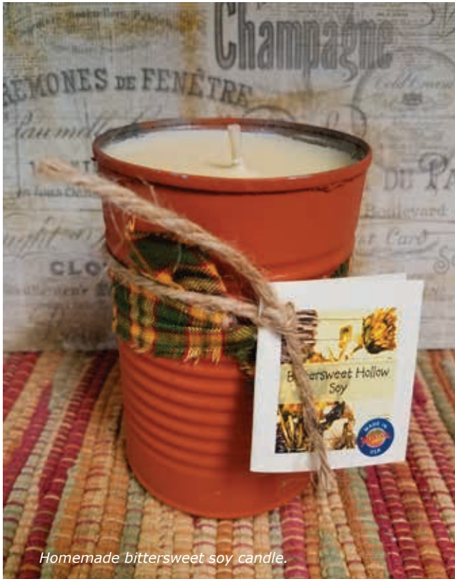
Homemade bittersweet soy candle.

Celebration” the first week of December. During the holiday season, The Shoppes will have limited-edition ornaments and plenty of holiday treats and drinks for you to enjoy during your shopping experience. Prior to Christmas, the store hours will be Wednesday through Sunday. The Shoppes will be located on the corner of Seventh and Lincoln.