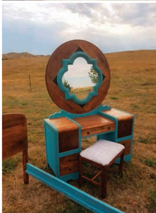
A glimpse of the unique custom furniture that will be available at The Shoppes.