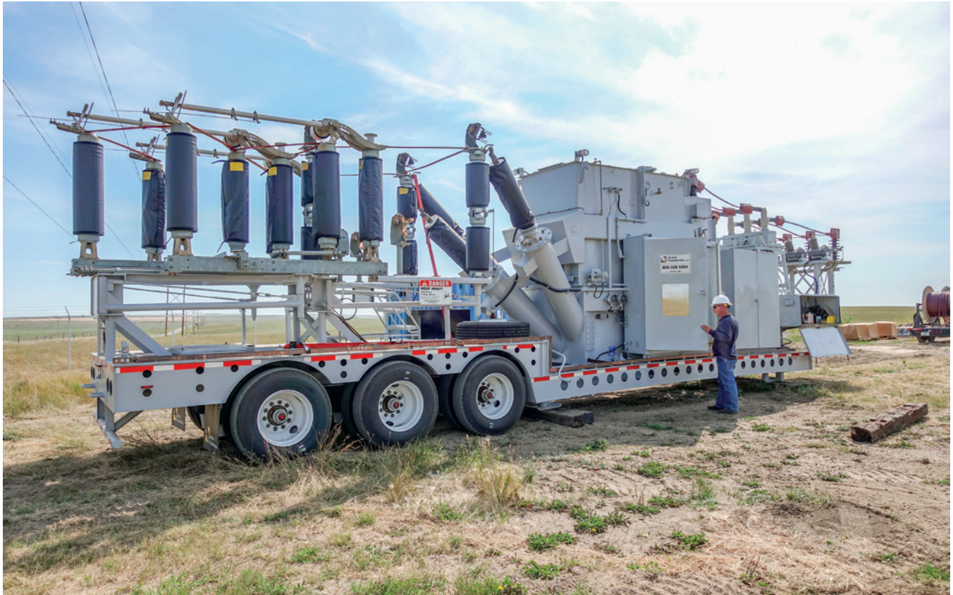
LYREC's mobile substation will provide temporary power while the construction of the new line is being completed.