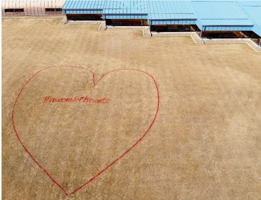
Lower Yellowstone Rural Electric Cooperative spread love on the lawn of its headquarters building to remind everyone that we are in this together. #aworldofhearts