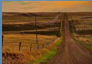
Miles and Miles