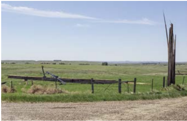
Several laminated poles snapped in the June 10 storm. These poles are rated to withstand 100-mile-an-hour winds with quarter-inch of ice.

W ind and hailstorms are not uncommon in our area. Typically, the storms do not last long or create too much turmoil. However, the storms that rolled through Lower Yellowstone Rural Electric Cooperative's (LYREC) service territory in June brought severe damage to our system.