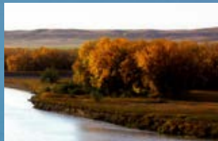
LYREC proudly serving those of the Yellowstone