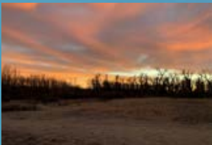
Lighting your homes even when the sun goes down