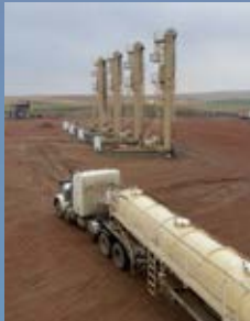
#Powering the Bakken