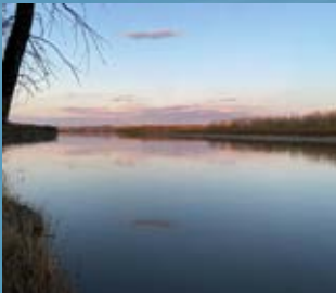
Wishing You Peace