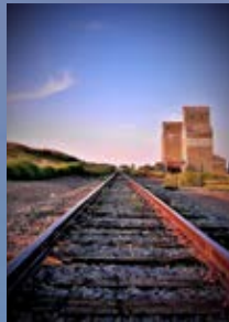
All tracks lead through Lower Yellowstone