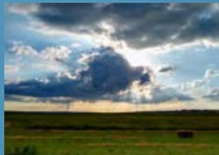
Greeting from Sidney, MT