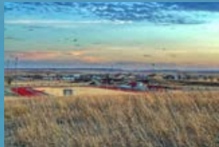
Enlightening your everyday life for years to come