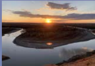
You're better than a Montana sunset...which says a lot ♡