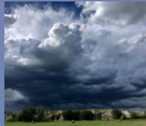
Eastern Montana. Beautiful. Authentic. Peaceful.