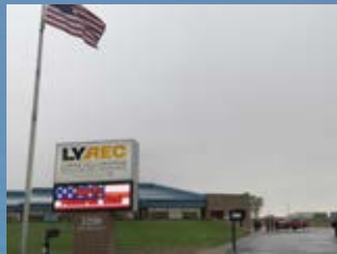
Love Your Rural Electric Company because we love you!