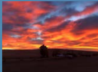
Fiery sunsets in Eastern Montana