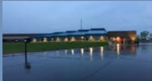
LYREC the power that never goes out!