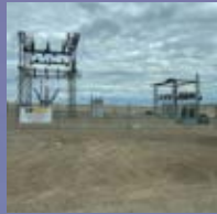
Lambert Substation on a rainy day