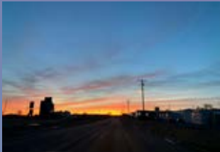
North Dakota Sunrise

For a chance at a $1,000 scholarship, the applicants needed to turn in a scenic photo they had taken from LYREC's service territory along with a tagline for their photo.