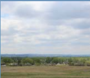
Sidney Soaring Spring