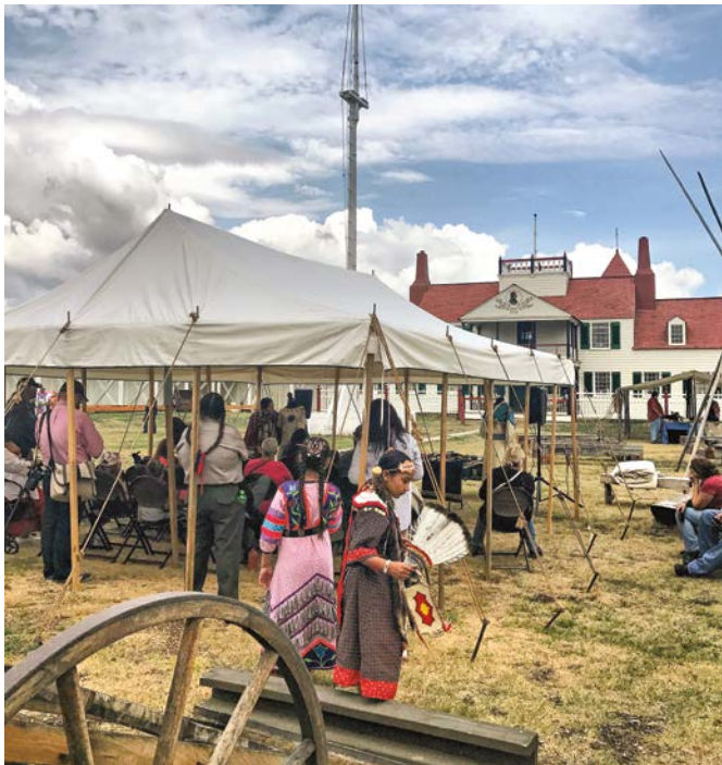
ORU granted the Fort Union Association $1,000 for the annual Indian Arts Festival. The festival serves to educate regional residents and visitors about the Mon-Dak area's rich history and culture. The funds will be used to bring traditional dancers and singers to the Indian Arts Festival.