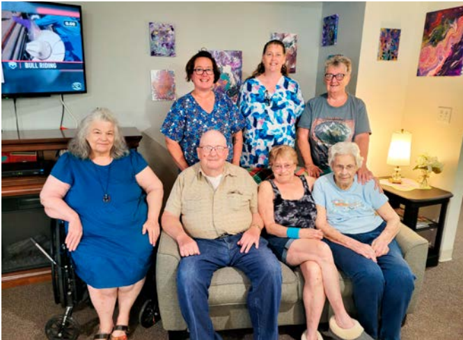
ORU granted $800 to the Savage Sunrise Manor to assist with the purchase of new microwaves and mini fridges for the residents' rooms. The Savage Sunrise Manor is an eight-bed assisted living facility located in Savage.

The ORU board meets quarterly to review applications. The next application deadline is Sept. 15. If you would like more information on ORU or would like an application, go to www.lyrec.coop . ■