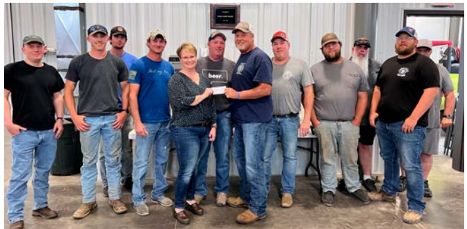
ORU granted the Fairview Volunteer Fire Department $1,200 to assist in the purchase of SEEK FirePro units. The units help the firefighters find potential flare-ups during a fire and also help in locating individuals in a rescue situation.